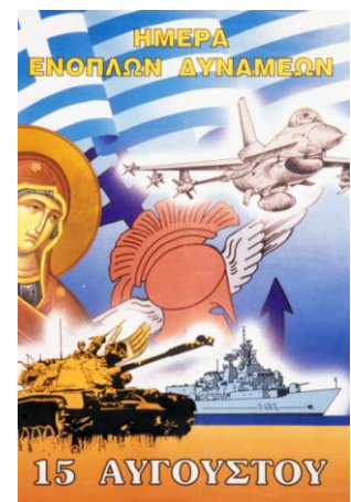
Fig. 7: A poster proclaiming 15 August as the Day of Military Strength.