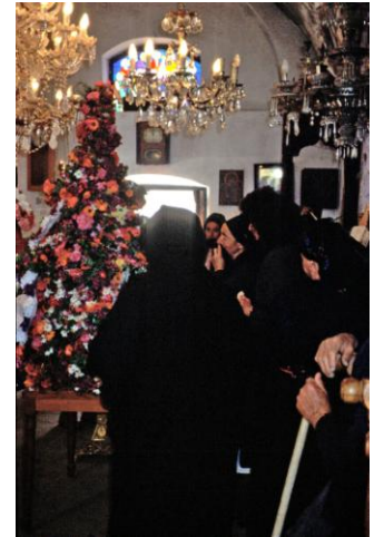
Fig. 6: Lamenting women in front of the Epitaphios (Christ’s funeral), Good Friday in the church of Olympos.

There is a female world-view and language, which differs from men’s (Håland 2006b). Traditionally women have used weaving to tell stories, such as Helena ( Il. 3.125-128) and Penelope ( Od. 1.356-358; ARV 2 1300,2). The rituals surrounding the loom are parallels to those of the sexual act (marriage), birth, childrearing, and death, since it is the life-cycle which is represented. We meet a world-frame constituted by women within an ostensibly male-dominated society (cf. Messick 1987). Through women’s laments (Fig. 6), festivals (Fig. 5) and daily life we find a “female universe”, where female activities exclude men, where the frame of reference is not their male relatives’, but rules and criteria established within this female universe.