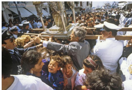
Fig. 2: During the festival celebrating the Dormition of the Panagia on Tinos, on 15 August, her miraculous icon (image) of the Annunciation is carried in procession, and also over the sick and women wanting to conceive.

The festival is an important means of communication, an offering or a gift, most often dedicated to a deceased guardian of society, alone or together with a god (dess), for instance to the modern Panagia (the Virgin Mary, cf. Fig. 2) or to the ancient goddesses, Demeter (Plut. Mor. 378e-f69, cf. HHD. 273 f.), Athena ( Il. 2.546-551) or Aphrodite. 6 In the festivals, we find fertility- and death-cult as well as healing (cf. also Håland 2005 and 2006a).