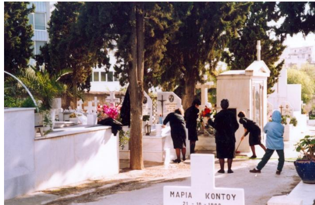
Fig. 1: “Female sphere” in public space: the graveyard, a space controlled by women.

The “male sphere” is usually connected with the official world, and the female with the domestic world, but as already stated, this does not imply that the female sphere is marginal and the