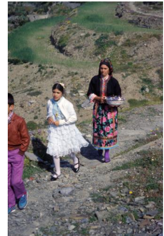
Fig. 4: Women and children rushing to the cemetery with sweets and cakes, in the village of Olympos on the island of Karpathos.

It is important to understand the cultural meaning of emotion ( Il. 22.33-90; Sappho. Fr. 83), which is different from the Western ideological focus on suppressing and hiding emotions and suffering. In Greece, a suffering mother may therefore present public performances in “being good at being a woman”. Her “public” audience most often is other women, who share her “public” space, interests and value-system, and therefore are interested in competing her performance in “being good at being a woman”, as in other respects, when they display, at home or publicly on “their tombs” at the memorials at the cemetery, when displaying their cooking abilities through the sumptuous cakes offered (cf. Fig. 4). They may be compared with the selected women who baked the offering cakes at the Panathenaia. Women seek to outdo each other in “being good at being a woman”. Their “public” audience, competitors and most critical commentators are other women who share the same value-system and interests. We meet the same